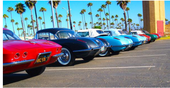
Parking lot scene'